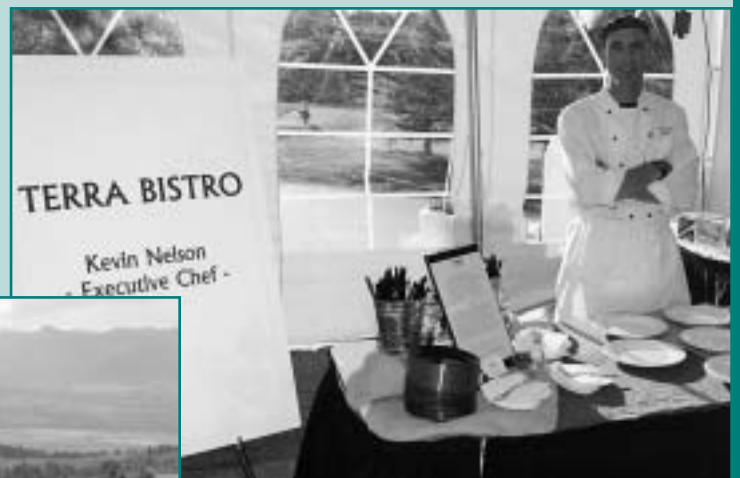
"Steadman-Hawkins Colorado Classic" will feature superb cuisine, courtesy of some of the Vail Valley's finest restaurants.