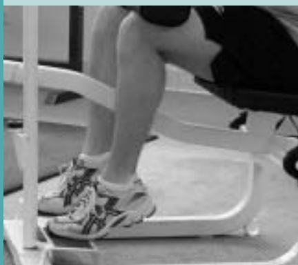
Seated Calf Press, 2