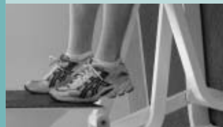
Calf Press 3