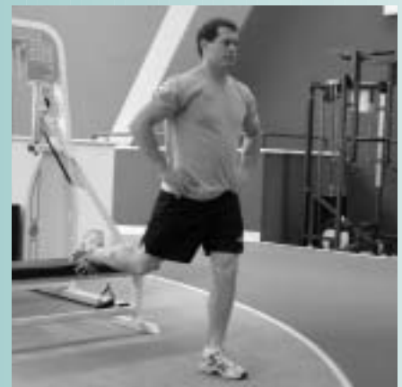
Balance Squat, 1