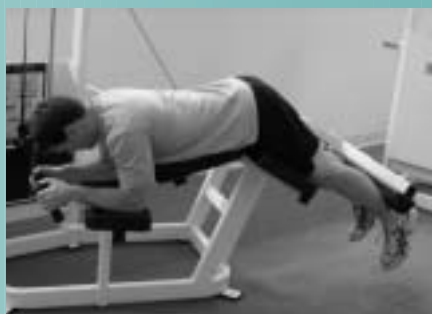
Hamstring Curl 1