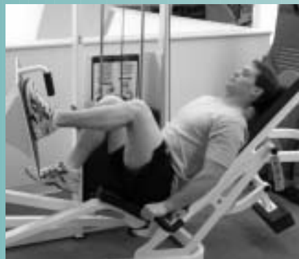
Single Leg Press