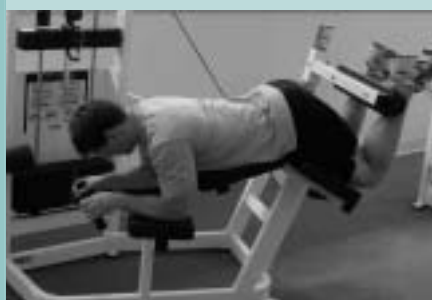
Hamstring Curl 2