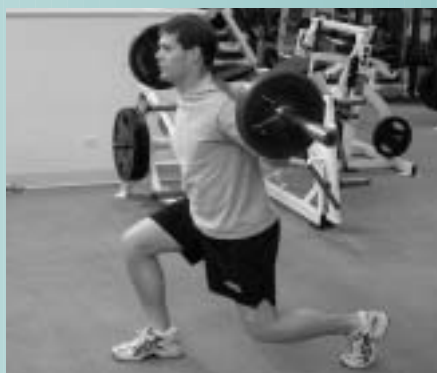
Reverse Lunge 1