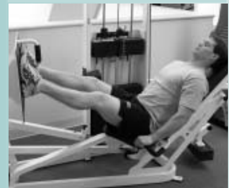
Double Leg Press 2