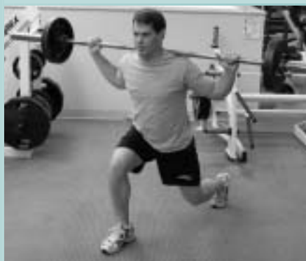
Reverse Lunge 2