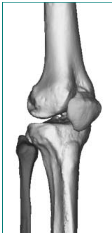
Three-dimensional model of the knee.

The Biomechanics Research Laboratory is heading up an ambitious project to determine why females are more prone to ACL injuries. By observing, in our lab, how females and males land differently from a jump, we have identified specific and consistent differences in how females land, some of which may make them more prone to ACL injury. Most obvious is the fact that females land less flexed at the knee joint. This puts the ACL in a position where it must withstand considerably more load than if they were to land in a more flexed knee position. With this information, Foundation Senior Staff Scientist Dr. Kevin Shelburne and Dr. Marcus Pandy of the University of Texas are working to develop a computer simulation of this motion. The hope is to understand just why the ACL ruptures in