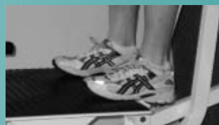
Calf Press 1