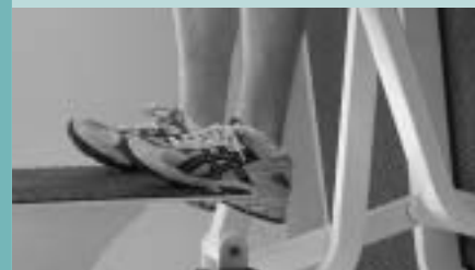
Calf Press 2