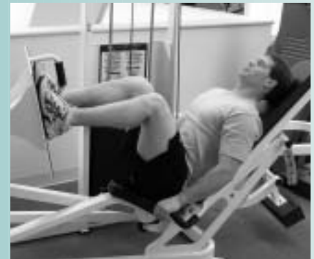
Double Leg Press 1