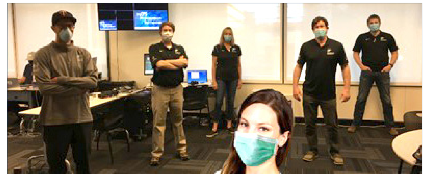
(BELOW) Broadcasting from the USOPC campus in Colorado Springs, the SPRI onsite team included researchers and members of the digital media and production team